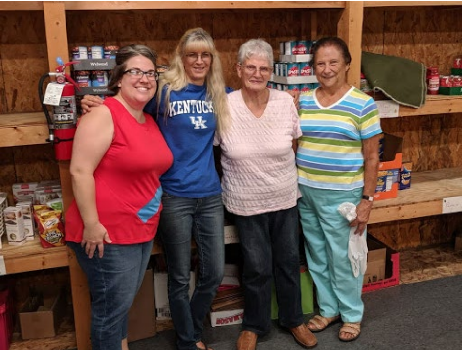
Pantry Volunteers in Campton.

..... “We could not operate this ministry without consistent help from faithful community volunteers.”