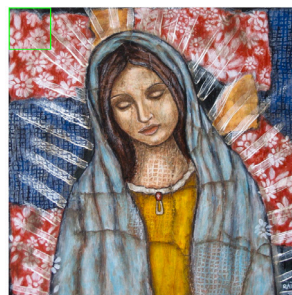
Our Lady of Guadalupe is a painting by Rain Rinin.