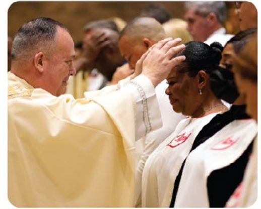
ONS PHOTO/QUELMO NANGIPANE, REUTERS