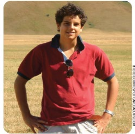
Blessed Carlo Acutis (1991–2006) served the needy and built an internet gateway for exploring eucharistic miracles.

The beatitudes offer us a blueprint for holiness. If we are poor in spirit, mourning, meek, hungry for righteousness, merciful, pure, peacemakers, or persecuted for doing what is right, we are on the road to sainthood. Reflect on one of the beatitudes. It can be one you do well or one that challenges you. Discern how you live it out and how you could live it out better. Slowly you will find yourself growing holier, and one day you will find yourself a saint in heaven. ●