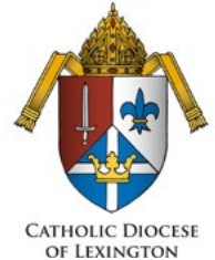
CATHOLIC DIOCESE OF LEXINGTON

1310 West Main Street Lexington, KY 40508-2048 Phone: (859)253.1993 www.cdlex.org